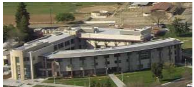
Aerial view of Science II which houses the department of criminology.