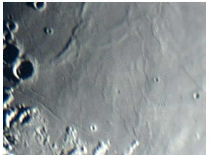
Tranquility Base, site of the Apollo 11 landing