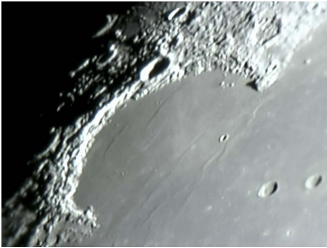
Sinus Iridium, the Bay of Rainbows

I took all these images with a $150 Philips ToUcam (pronounced "To-YOU cam") through the 16-inch Meade LX200 telescope at Fresno State's Campus Observatory. The free program Registax selected the best individual video frames.